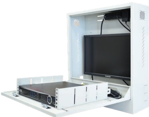
Compact Vertical Design