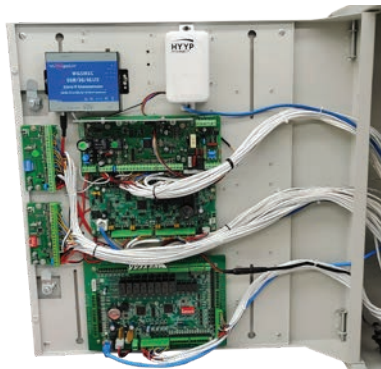
Capacity for Multiple Systems