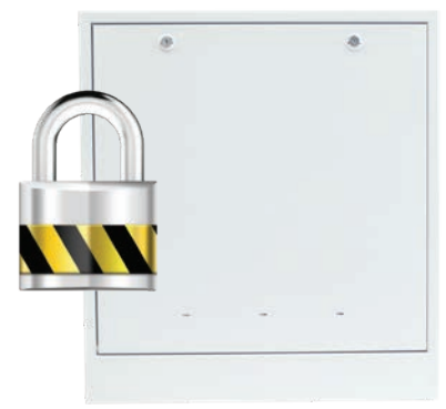
Dual Lockable Cabinet