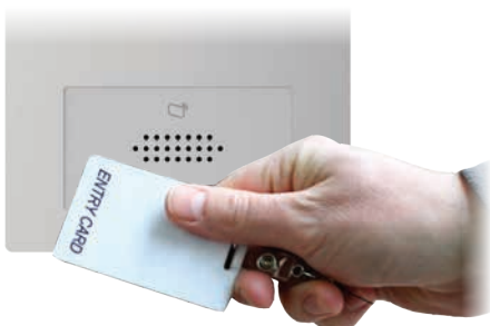
Gate Control via Keypad or Card