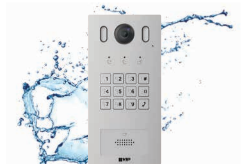
Weather & Vandal Resistant