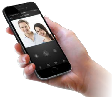
Remote Access & Answer via App