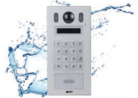
Weather & Vandal Resistant