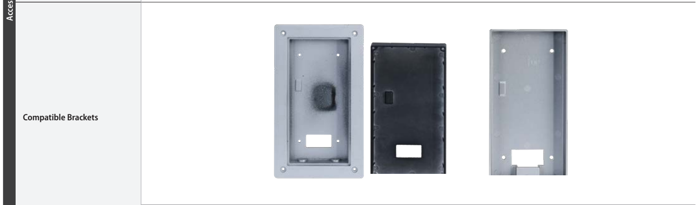
Flush Mount (INTIPADSDFB) / Surface Mount (INTIPADSDSB)

Your local VIP Vision™ IP solutions professional: