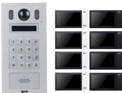
Connect up to 200 Indoor Monitors