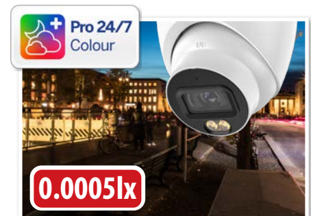
Superb Low Light Performance