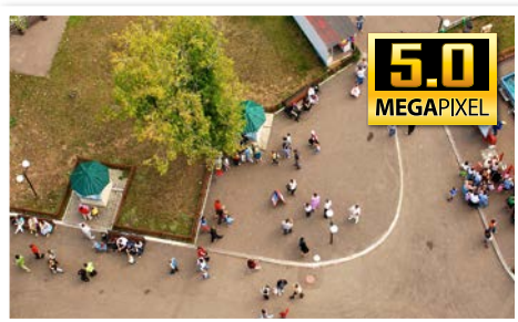
Record Beyond Double Full HD