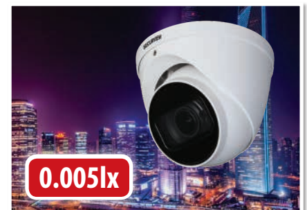
Superb Low Light Performance