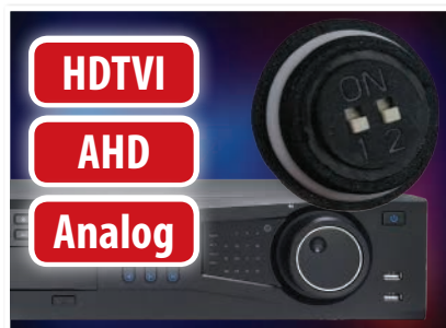
DVR Cross Compatibility