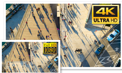
Stream Ultra HD over coax