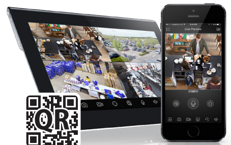
Remote view from your device