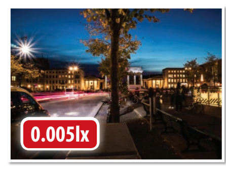
Superb Low Light Performance