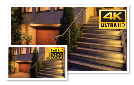
Ultra HD Recording Over Coax