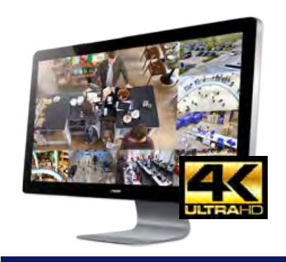
4K/Ultra HD Live View / 2CH Record