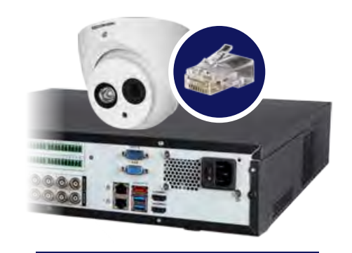
Add up to 64 IP video inputs